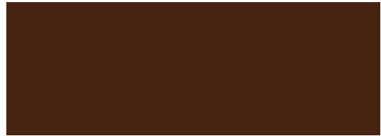
Buffalo Brown N 09412