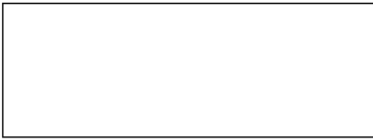
Fish Eagle White N 14128

The Code along side the paint colour name refers to the Arcelor Mittal Reference Number