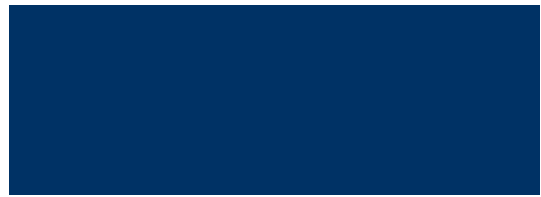
Azure Blue N 01109

The Code along side the paint colour name refers to the Arcelor Mittal Reference Number